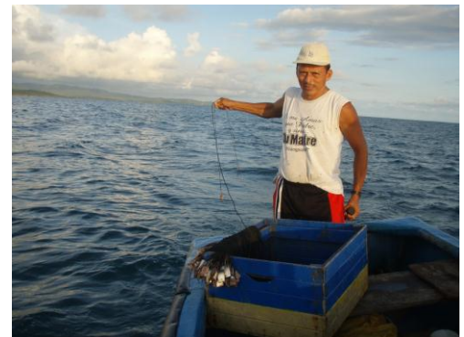
San Juanillo fisherman releasing a bottom longline.

*This donation will support 80% costs of circle hooks and the San Juanillo Fishermen Association will cover the other 20%.