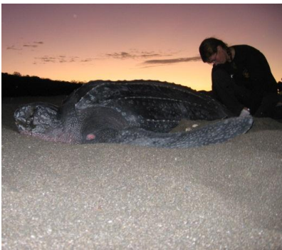
Critically endangered leatherback sea turtle nesting at Ostional beach.

both species linger during the season in the coastal area around the refuge breeding and feeding; a situation that makes them especially vulnerable to fishing activities. The fishermen in San Juanillo have identified the opportunity to use circular hooks as a better fishing method to be enforced in the responsible fishing area of San Juanillo, this will help reduce the mortality of turtles by incidental fishing and promote responsible fishing. The circular hooks not only help turtles, but the shape reduces catch of dolphins and rays.