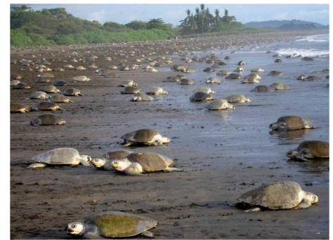
Olive ridleys arribada in Ostional Beach.

In this coastal area responsible fishing is especially important due to the closeness to Ostional beach, a wildlife refuge considered the second most important nesting beach for the olive ridley ( Lepidochelys olivacea ) turtles in the world (Valverde 2007). These turtles synchronize for nesting in spectacular displays known as arribadas – Spanish for arrival – where thousands come ashore to nest together over a period of just a few days. Today olive ridley arribadas are only witnessed on a handful of beaches along the Central American Pacific coast, and Ostional is one of these. Not only olive ridleys nest here, but also the much endangered Pacific leatherback, a turtle which population size reduced to 10% over the last 20 years. Males and females of